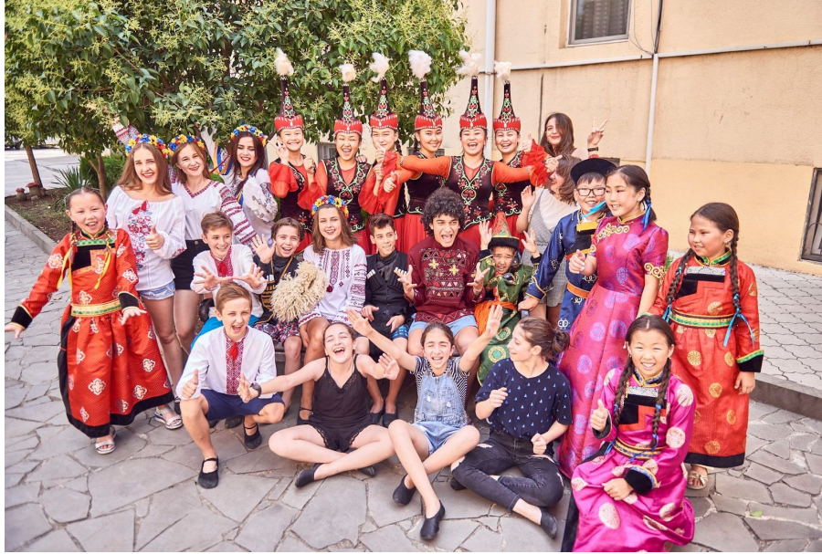
Brave Kids Georgia 2018 Participants

Brave Kids is a unique cultural-educational project dedicated to uniting children from different parts of the world in a common creative endeavor. Children and youth participate in the exchange of their artistic skills, traditions, and cultures, while also creating a platform to discuss the problems that affect many communities around the globe.